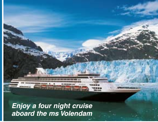
Enjoy a four night cruise aboard the ms Volendam

Skagway • Denali National Park • White Pass Railway • Glacier Bay Nat'l Park